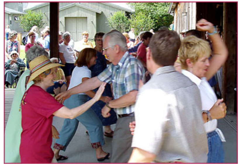
Celebrating the Feast of St. Benedict with a traditional contradance

Mid-month, a group of brothers visited the mosque in the Islamic Society of Vermont, in Colchester. Aware of the unjust climate of suspicion and prejudice directed at Muslims and Arab-Americans in our country, we hoped to offer a simple sign of solidarity with the Muslim community in Vermont, by asking to attend Friday prayers. The response was immediately "Yes," and the hospitality extended to our brothers was exceptional. When Friday Prayers were completed, the brothers were invited to stay for conversation and a sharing of experiences, which lasted for more than one hour.