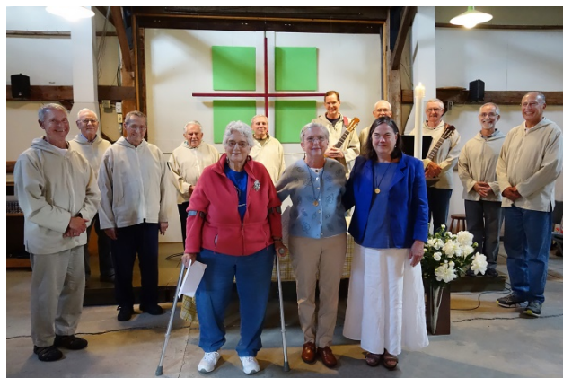
Our three new oblates with the brothers.

On June 27 th a small group of three oblates made their oblation in the Stone Chapel gathered together with others in the oblate community, friends, and our community of brothers. This becomes the third occasion that oblations have been celebrated here at the priory since renewed interest was initiated in November of 2015.