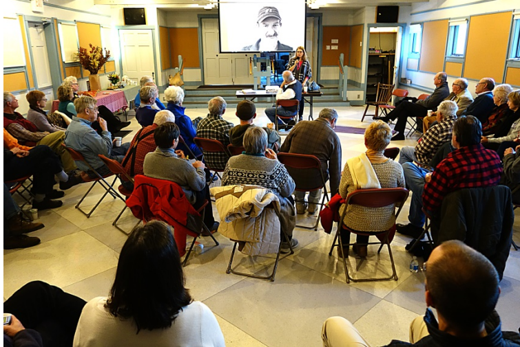
Meeting of Dismas of Vermont in Weston Priory Visitors' Center.

On the weekend of November 10-12 more than 40 board members of Vermont's four Dismas Houses, which offer Gospel-inspired transitional housing for men and women leaving incarceration, held their annual retreat at the priory. Our community participated in a Saturday afternoon open discussion and video presentation on the impact of the Dismas charism on the lives of individuals who are making a transition as well as on the lives of staff, volunteers, and the wider community. ■