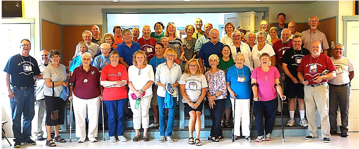
VAMOS In Mexico 30 th Anniversary gathering in the Weston Priory Visitors' Center.