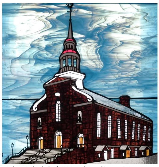
The C athedral of St. Joseph, Burlington, V ermont