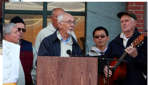
Weston Priory brothers