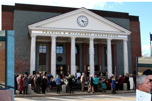
The Francis B. McCaffrey Courthouse