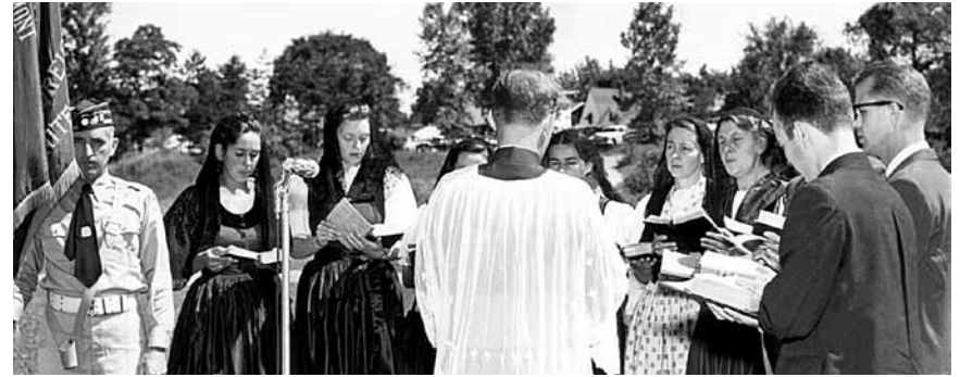
South Park, Burlington, Trapp family singers, 1953