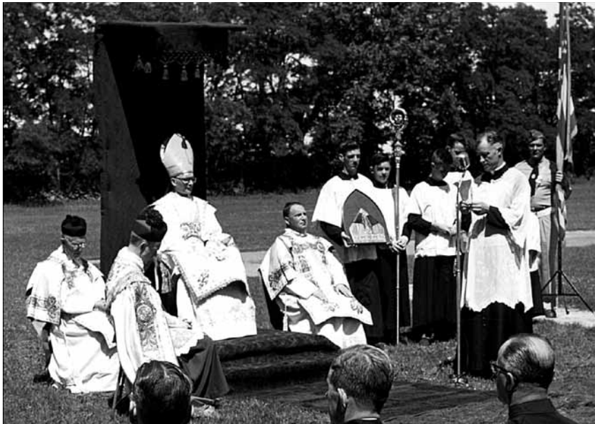
South Park, Burlington, Abbot Leo presiding at Pontifical Mass, 1953

Our scanner is a great gift of contemporary technology and makes it possible to share the contents of a faded and crumpled two-page, 8½" x 14" document that might otherwise have gone quite unnoticed. It works wonderfully well but does need a little help in translating some of the blemishes and distortions that creep in with aging: