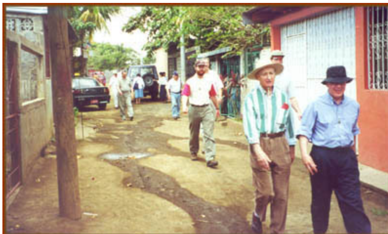
Walking through the barrio

After a warm greeting by the Mexican Benedictine sisters, the brothers are escorted to the barrio where the sisters have a small house that serves as a novitiate.