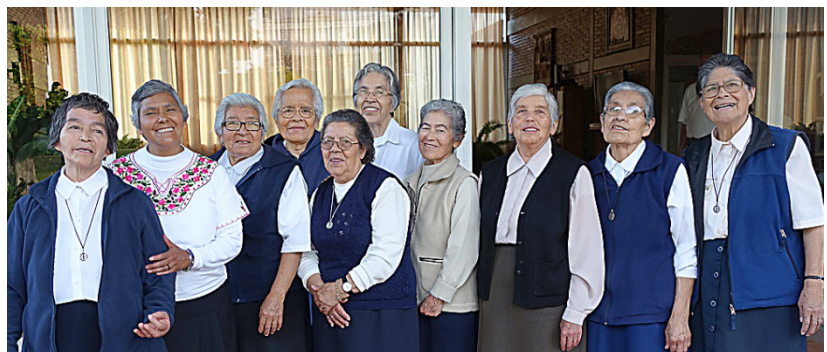
Our Benedictine Sisters at the Guadalupe Center in Cuernavaca.

Most of the brothers traveled to Mexico from the 13 th to the 28 th to be with our Mexican Benedictine Sisters and to celebrate 40 years of the love and friendship that have marked our ongoing intercommunity